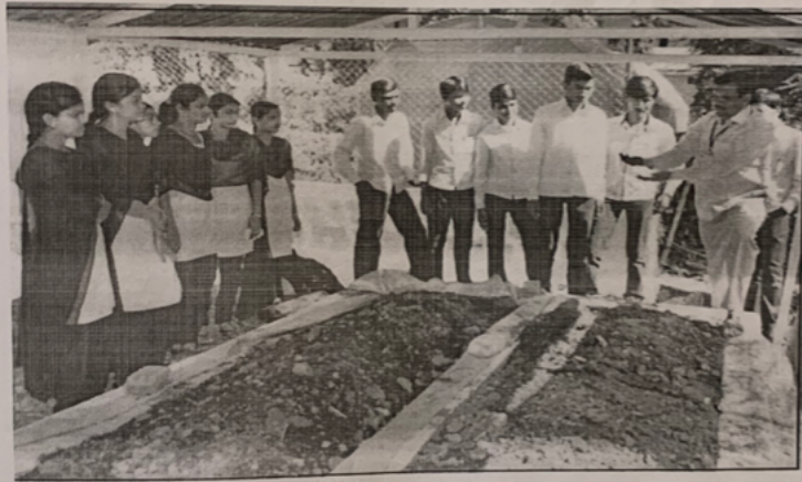
Solid waste collected is decomposed to vermi compost.