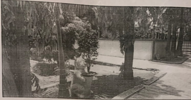
Dustbins are placed at various places in campus.